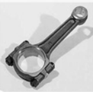
STREET & STRIP